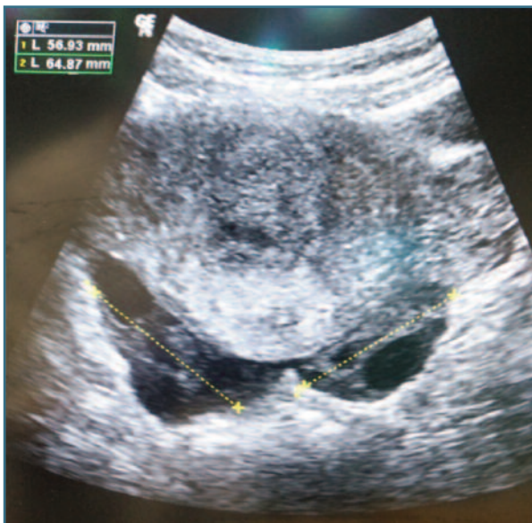
FIGURE 4. Transabdominal view after uterine evacuation – bilaterally enlarged ovaries (56- and 64-mm largest diameter, respectively), with multiple cysts, suggestive of theca lutein cysts.

te dehydrogenase (LDH) 454 (<220) U/L and uric acid 6.5 (<6.0) mg/dL, thyroid stimulating hormone (TSH) 0.23 (0.35-4.94) \mu UI/mL, but normal free thyroxine (T4) and severely increased \beta -hCG (646.000 mUI/ml), with no other relevant changes.