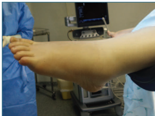
FIGURE 1. Peri-malleolar oedema at admission to the Hospital.

We present the case of a primigravida in her early 30s, with previously known well-controlled asthma and no other relevant medical history. At 17 weeks gestation, she was transferred to our Hospital from her Primary Health Care Unit where severe hypertension (220/180 mmHg) was detected on a routine visit. She complained of peripheral oedema up to the knees, with progressive worsening, over the last 2 weeks. Additionally, she reported episodes of epigastric pain, indigestion and vomiting during the same period. She denied having headaches, blurred vision or other accompanying symptoms. On physical examination, she presented persistent severe hypertension (185/120 mmHg) and bilateral soft peri-malleolar oedema. She had no other