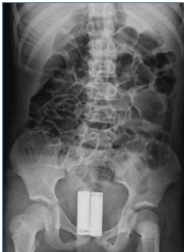
FIGURE 1. Abdominal X-ray revealing two parallel radio opaque foreign bodies in the vagina

diseases was performed (and negative) and the police authorities were informed of the situation.