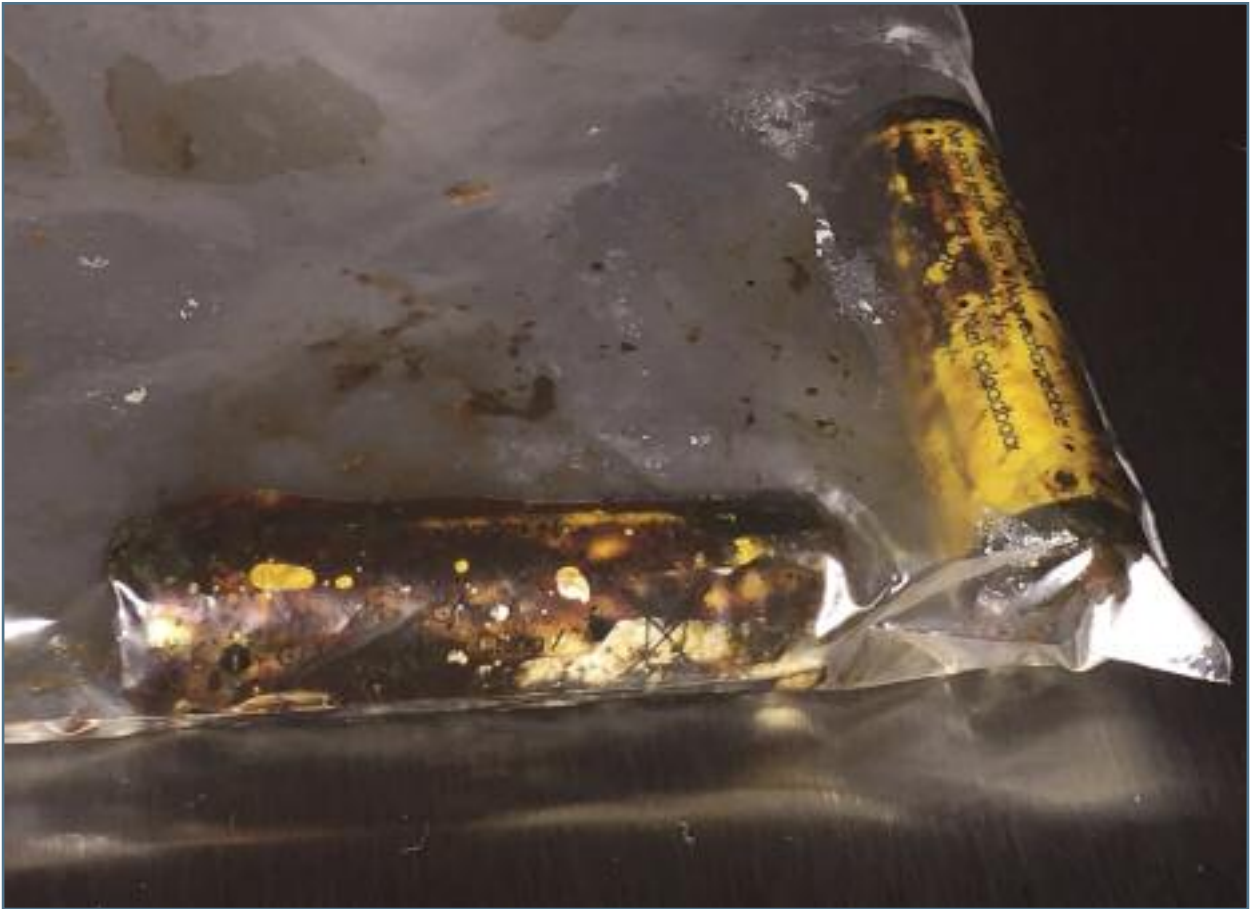
FIGURE 3. Two alkaline batteries removed

Following the removal of the alkaline batteries the symptoms disappeared completely except for the vaginal discharge which persisted for a few days.